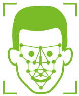
Access Control System

Our Pro series tripod turnstiles represent classic and safe way to protect your premises. They are used in various indoor environment applications. They fit perfectly as an economical option in the office buildings and other related applications.